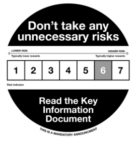
Based on the Class A USD Acc share class.

Lipper Ratings for Total Return is supplied by Lipper, a Refinitiv Company. Copyright 2024 © Refinitiv. All rights reserved. Lipper shall not be liable for any errors or delays in the content, or for any actions taken in reliance thereto. Lipper taken on representative shareclass.