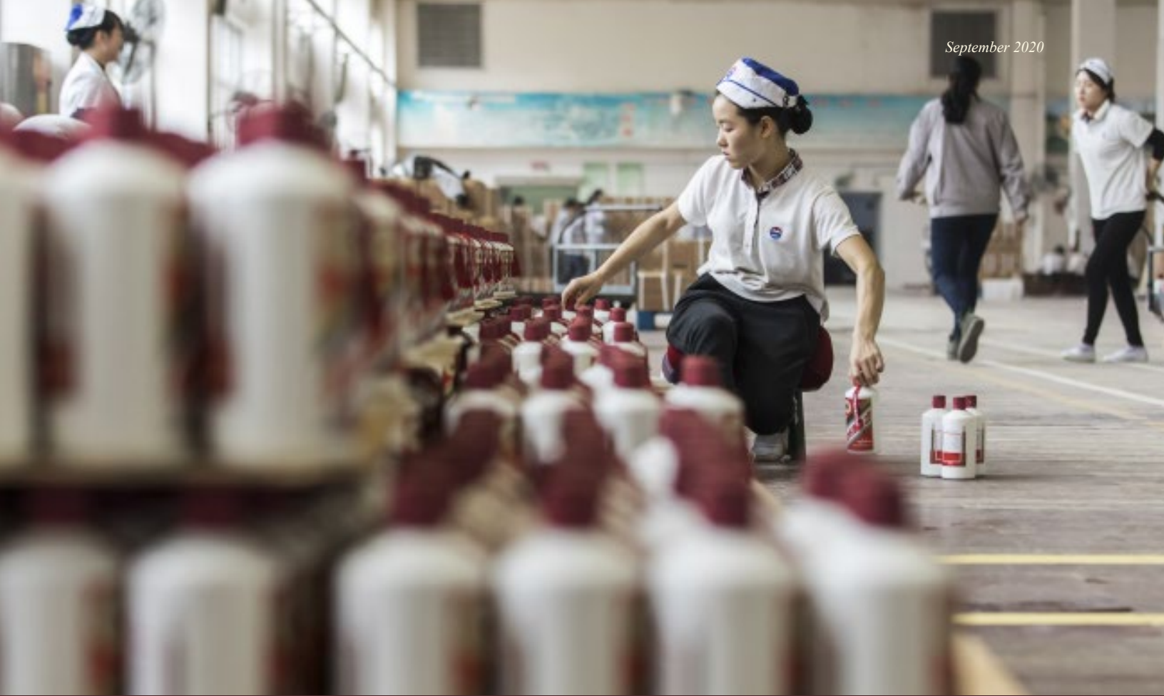
Baijiu Production Inside China's Biggest Distiller Kweichow Moutai Co.