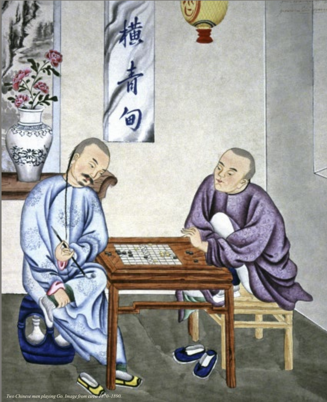
Two Chinese men playing Go. Image from circa 1870–1890.

You can't win at go with a chess mindset