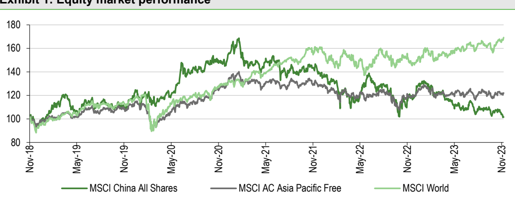
Exhibit 1: Equity market performance

From this perspective, it is thus still early days for BGCG and the trust has had a difficult start. In the three years since BGCG was established, China has been hit by an unprecedented series of challenges, some of its own making, such as an aggressive and unexpected regulatory clampdown, harsh restrictions in response to the COVID-19 pandemic and an escalation in geopolitical tensions with the US. These developments all damaged consumer and investor confidence and private sector activity, and weakened equity markets.