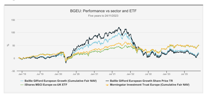
Fig.2: Five-Year Performance

For the record, we show below BGEU's five-year returns. The trust has delivered a NAV total return of 20.7% compared to a total return of 49.1% for the iShares MSCI Europe ETF and a weighted average of 51.1% for the Morningstar Europe sector. However, we note that around a year of this was generated under a different manager with a very different strategy.