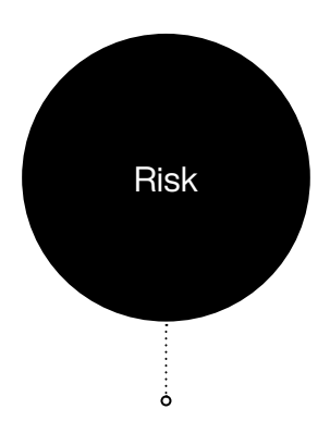
Annualised volatility of returns over rolling five-year periods that is below 10%

A positive return over rolling three-year periods